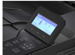
A tilting 4-line LCD panel graphically displays supply levels and system status.

The P 501M supports PCL 5e, PCL 6 and PostScript3 emulation with simple point-and-click drivers and dozens of fonts for creative printing in many styles onto media up to 8.5" x 14". Print up to 999 sets per job at 45-ppm and feed envelopes and labels from every source. The Bypass Tray extends media length up to 35.4" for banner and signage printing. Place watermarks on pages and add covers, slip sheets and chapters to create more professional-looking documents. Install the optional 320 GB hard disk drive to take advantage of a cluster of printing modes designed to enhance productivity and confidentiality, and securely store up to 9,000 pages of data for print-on-demand.